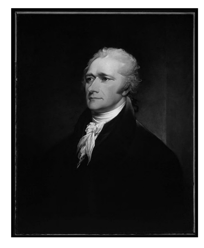
Fig. 2: Alexander Hamilton by John Trumbull, ca. 1806