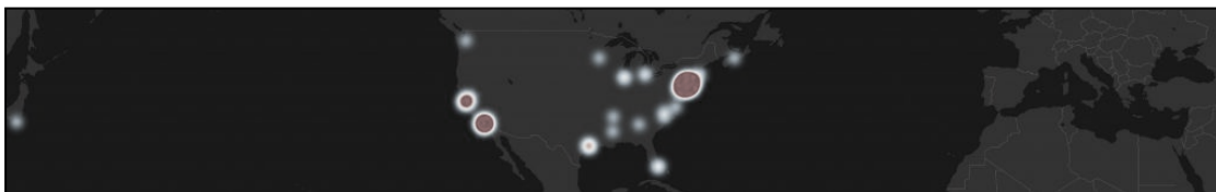
Fig. 4: Occurrences of wack in music lyrics by region.

While the term wak/wack is most closely associated with the Native Black American population – occurring most frequently among those hailing from the New York/New Jersey regions of the United States – as the above social media examples illustrate, its present-day usage has expanded beyond the borders of the New York/New Jersey region (and ethnic boundaries). To wit, among the social media examples are users as far away as New Orleans, Louisiana. The same phenomenon is readily witnessed in the geographical breakout of occurrences of wak/wack in music lyrics, as evidenced by The Right Rhymes (see fig. 4 ). This phenomenon may well be the result of transmission in travel (as it was once standard practice for Native Black Americans in the northern United States to travel back to the South periodically to spend time with elders and extended family for extended periods) or the dispersal and displacement of Native Black Americans native to the New York/New Jersey regions of the United States Northeast – many of whom have moved to regions extramural to the former Dutch colony (particularly to the United States South and Southwest).