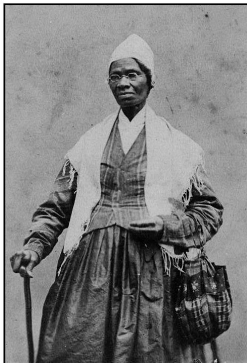
Fig. 3: Sojourner Truth, circa 1864. Truth spoke a Dutch-based language in the former Dutch colony.

The absence of literature on Negro Dutch – and, by extension, Dutch – linguistic survivals among Native Black Americans suggests general support for Dillard’s contention. However, the careful study of the lexicon of Native Black Americans reveals that unique Negro Dutch retentions did, in fact, survive and were ultimately absorbed into the greater language of the Native Black American population of the United States. These Negro Dutch survivals continue to permeate Native Black American Language, with specific Dutchisms occurring among this ethnic group with noticeable frequency and authentic utility.