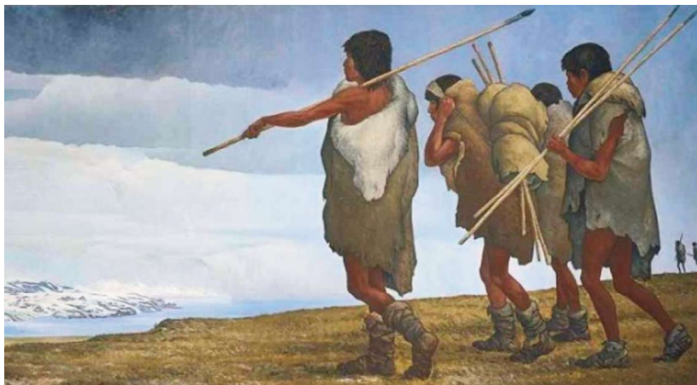
Figure 1: El Paso de Bering (Iker Larrauri 1964)

ways that should be taken into account more often. The shift in the project toward problems of documentation and preservation brought into sharper focus the historical questions because of the greater importance of better understanding language replacement (often termed: first language attrition). 2